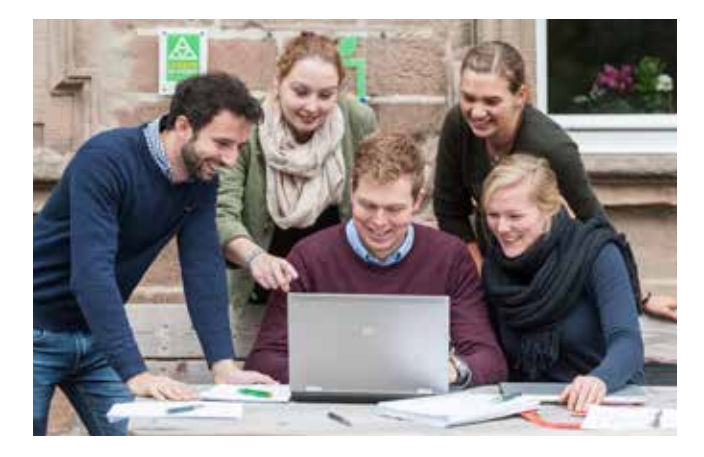
Furthermore, the DLG Academy organises the exclusive DLG Trainee Programme for junior staff in the agricultural sector.

The DLG Academy offers a broad range of seminars, workshops, e-learning modules and training courses for agriculture and agribusiness. Topics include business management, arable farming, livestock husbandry, renewable energies, sustainability, sales and marketing and financial advice. www.DLG-Akademie.de